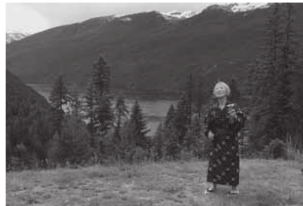
Still: Falling from the Sky