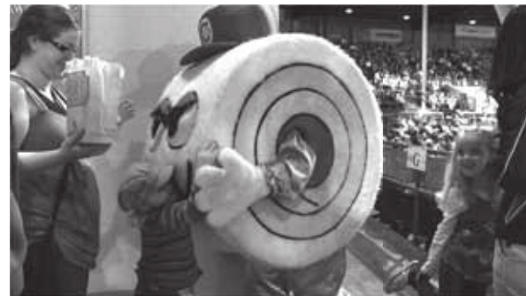
Still: Oh! Sushi – From the Land of the BC Roll with Love